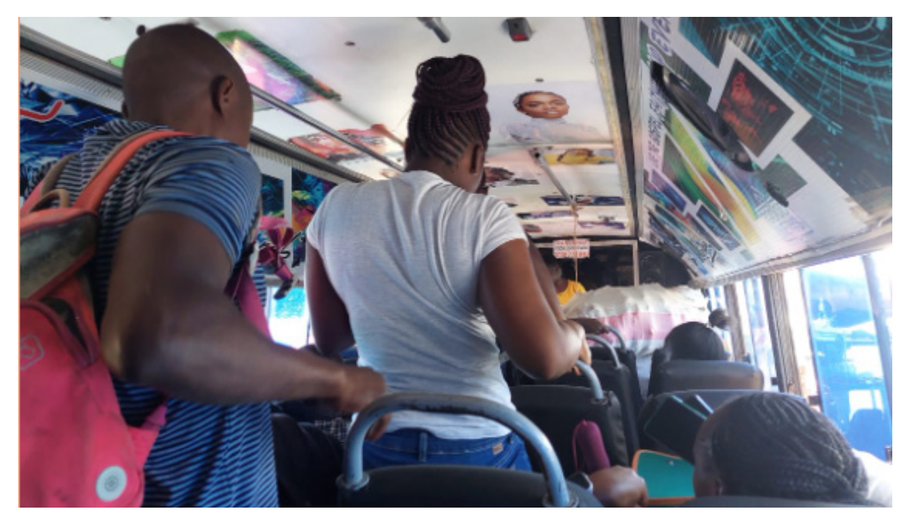
"Matatu," a public city bus regularly used by Sama moderators. The company used to have a van service for workers to get to the production floor, but this benefit was taken away in retaliation after workers publicly spoke about labor conditions at Sama.

there to find a place to sit in. The production floor is incredibly loud. It's hard to find a constant convenient place to sit or to make friends that last because everyone moves in groups. One is not allowed to move from their chair, you can't interact with other coworkers during production time, you can't talk to people, or even browse anything on the internet to distract yourself because you are under surveillance CCTV and supervisors would rotate creeping on your back or patrolling you every now and then, so we are forced to consume very harmful content back to back non-stop until break time," she revealed.