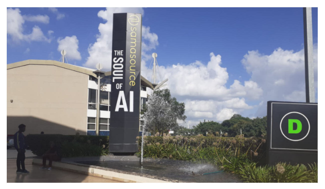
Sama's building in Nairobi, Kenya