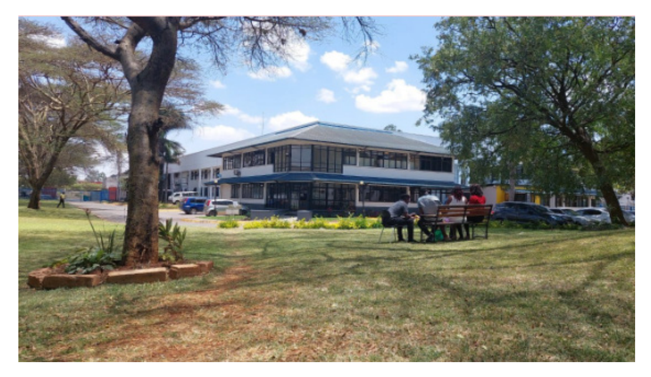
The production floor where content moderators work for Meta. It is a secluded area behind Sama's main building.

away the transportation service abruptly," said Ava.